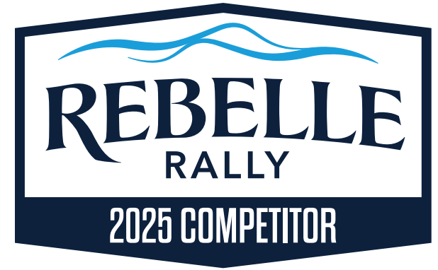
2025 Competitor Logo_flat