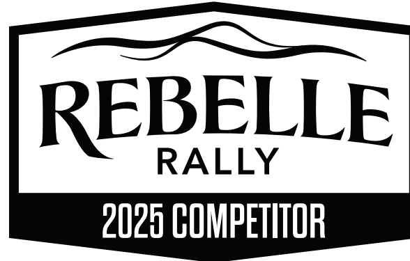
2025 Competitor Logo_1 color